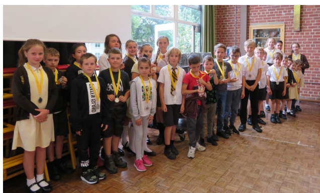
29 Silver Medals