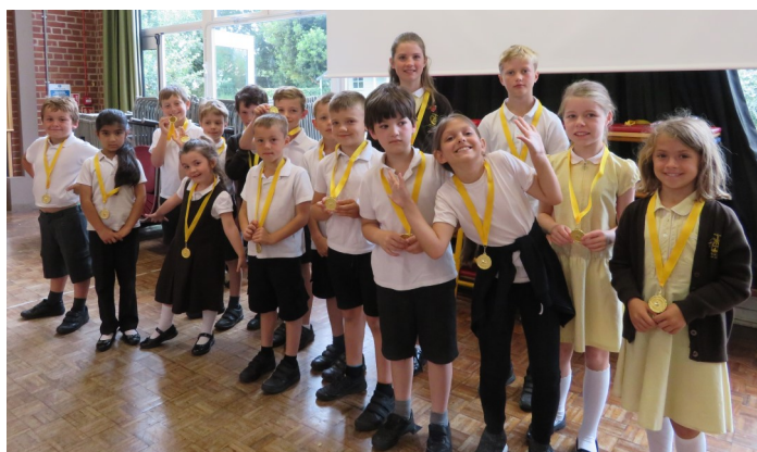
16 Gold Medals