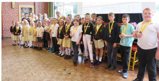
32 Bronze Medals