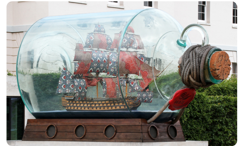
Nelson's Ship in a Bottle

Nelson's Ship in a Bottle (2010) by Yinka Shonibare was the first commission for Trafalgar Square by a black artist. It symbolises and celebrates the story of multiculturalism in London.