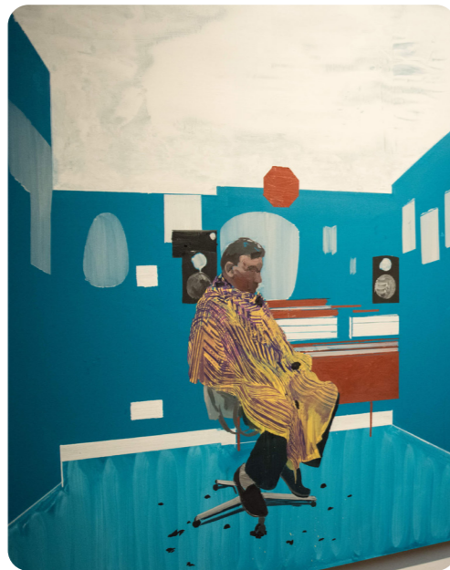
Peter's Sitters 3

Peter's Sitters 3 (2009) by Hurvin Anderson connects his Caribbean heritage with life in England. Colour symbolises his Caribbean heritage, while the barbershop symbolises an important aspect of life in England to Afro-Caribbean immigrants.