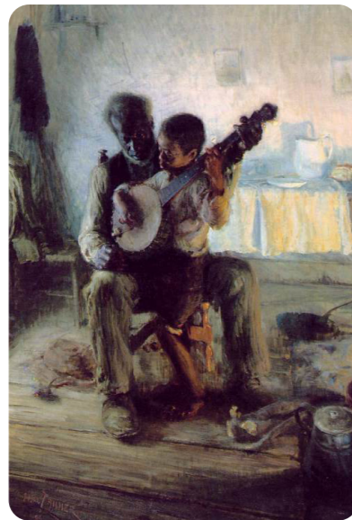
The Banjo Lesson

The Banjo Lesson (1893) by Henry Ossawa Tanner shows an elderly man teaching a young child the banjo, symbolising the resilience, intellect and caring nature of the once enslaved African American people.