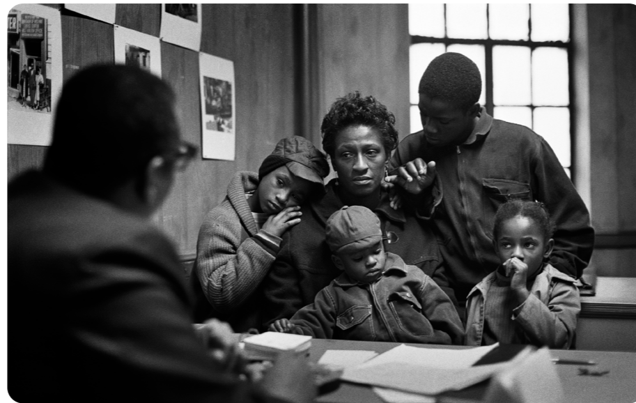
The Fontenelles at the Poverty Board

The Fontenelles at the Poverty Board (1967) by Gordon Parks shows a poor, black family in New York, symbolising the hardship many endured in the USA.