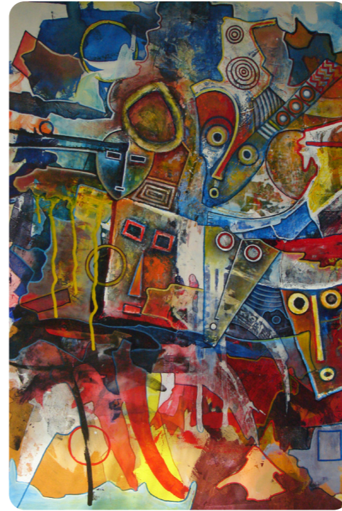
Another Call from Africa

Another Call from Africa (2009) by Turgo Bastien uses bright colours and African masks to celebrate African culture. Masks play an important spiritual and religious role in African societies and are therefore a significant feature within Turgo Bastien's work.