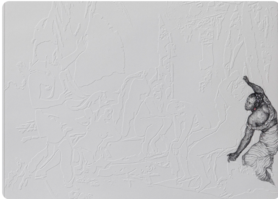
Vanishing Point 7