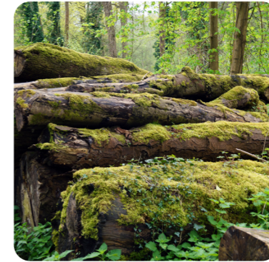
under logs and stones