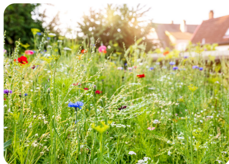
wild, uncut areas