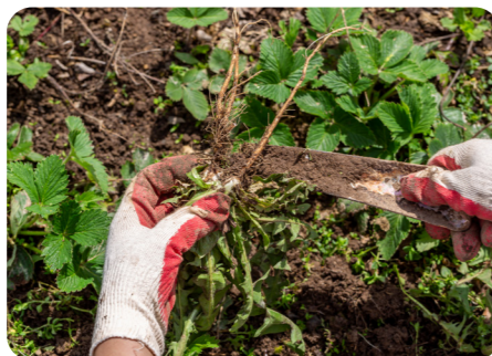
weeding by hand