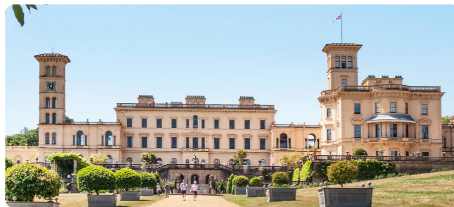
Osborne House is on the Isle of Wight, England.