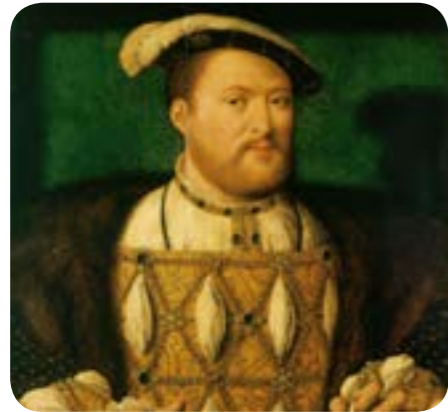
Portrait of Henry VIII by Joos van Cleve, c1530–1535

A portrait is a painting or photograph of a person. It usually shows their head and shoulders, but may show their whole body. Before cameras were invented, kings and queens often had official portraits painted to show how powerful and important they were.