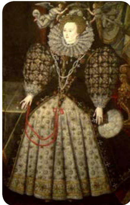
Portrait of Elizabeth I of England attributed to Nicholas Hilliard, 1590