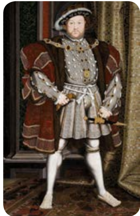
Henry VIII by Hans Holbein the Younger, 1537–47