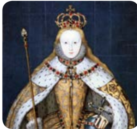
Coronation Portrait by unknown artist, c1600