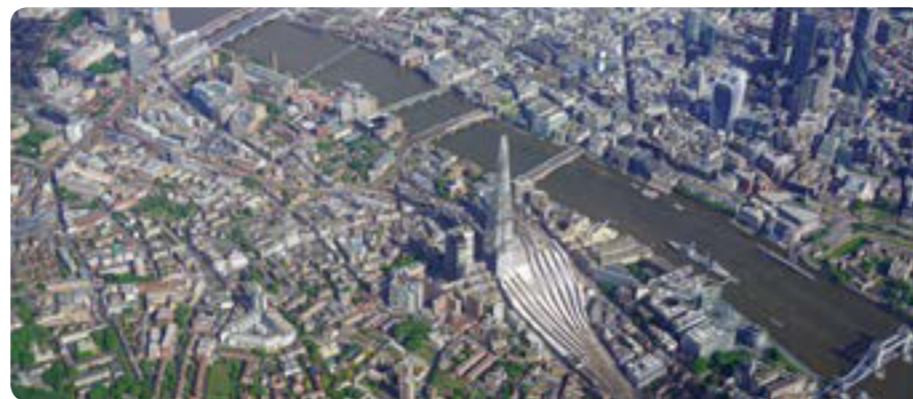
Aerial view of London

A city is a large, busy settlement where lots of people live and work. A city usually has a cathedral, a river, important buildings and offices where people work. There are lots of things to see and do in a city. There are many shops and restaurants to visit.