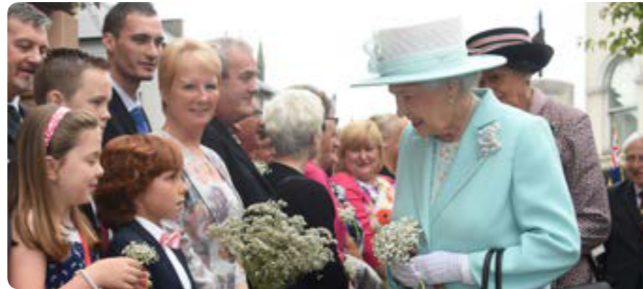
The Queen meets lots of people

Elizabeth II is the monarch of the United Kingdom. She was born in 1926 and became queen in 1952. She was married to Prince Philip and has a large family. She lives in Buckingham Palace in London. The Queen is very important. She visits charities and schools in the United Kingdom and welcomes world leaders to Buckingham Palace.