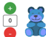
Add or delete objects from the Pictogram