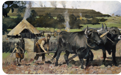
Artist's impression of Iron Age arable farming