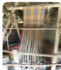
Colourful cloth weaving