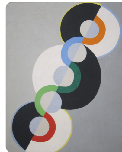
This painting, by Robert Delaunay, is called Endless Rhythm . It represents the movement of music through endlessly connected circles and loops.

Orphism was an abstract painting style developed by married artists Robert and Sonia Delaunay around 1912. It was based on Cubism but pioneered a new emphasis on bright colours and abstract shapes to create energy and movement.