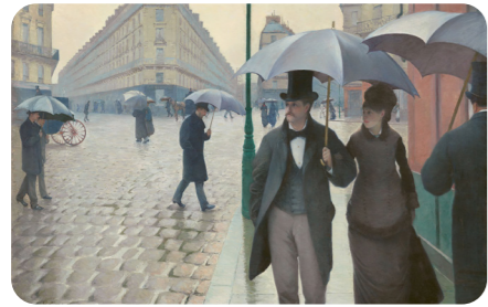
Paris Street; Rainy Day by Gustave Caillebotte, 1890