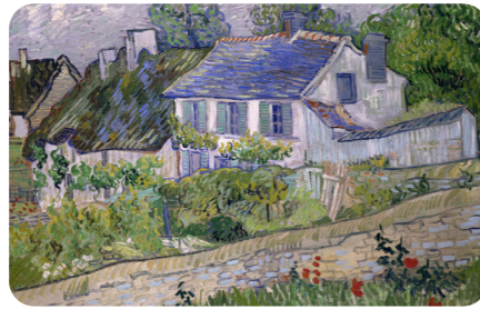
Houses at Auvers by Vincent van Gogh, 1890