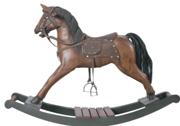
wooden rocking horse