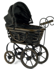
wood and metal pram