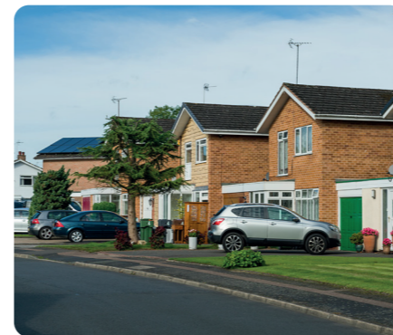
A street today.