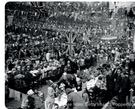
Street party to celebrate the coronation.