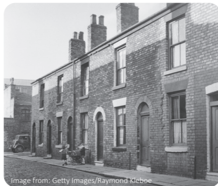
A street in the 1950s.

The way people use land changes over time. For example, in the 1950s there were fewer cars, so fewer roads were needed. Today lots of people have cars, so there are many more roads for people to drive on and driveways for parking.