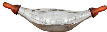
Victorian baby bottle

An artefact is an object from the past. Museums often display historical artefacts. Artefacts can tell us about how people used to live. Everyday objects like baby bottles, clothing, toys and books can tell us about childhood in the past.