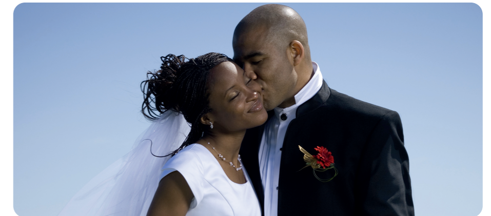
Weddings happen when two adults get married.