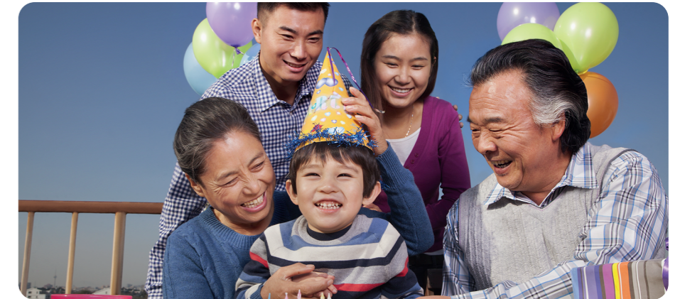
Birthdays happen every year.

Important life events include birthdays, religious festivals or family celebrations. Some life events happen every year and some happen at certain stages of human life.