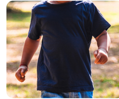
A cotton T-shirt is soft and stretchy.