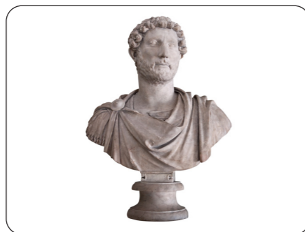
This statue is made from stone.