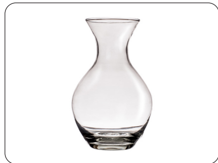
This vase is made from glass.

Materials are all around us, such as in the home, garden, school and park. They are important because we use materials to make the objects we use every day.