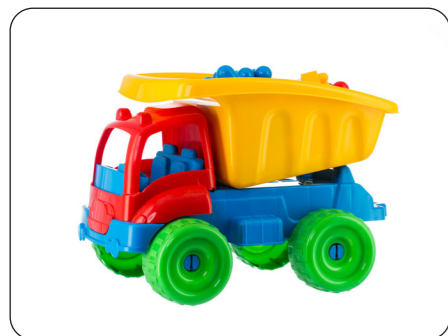
This toy is made from plastic.