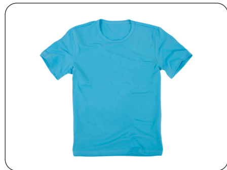
This T-shirt is made from fabric.