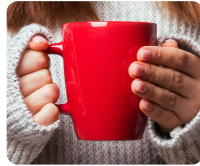
A ceramic mug is hard and waterproof.