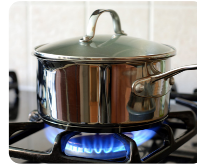
A metal pan is smooth and shiny.