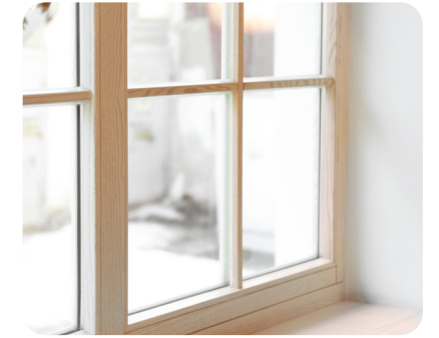
A glass window is hard and transparent.