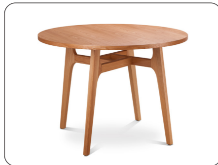
This table is made from wood.