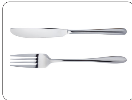
This cutlery is made from metal.