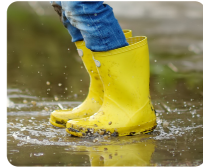
Rubber wellies are waterproof and bendy.