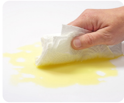
A paper kitchen towel is soft and absorbent.

A property is a quality that a material has. Materials can be described by their properties, such as hard, soft, stretchy, bendy, transparent and waterproof. Materials have different properties, which make them suitable for making different objects.