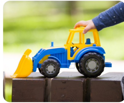
A plastic toy is hard and smooth.