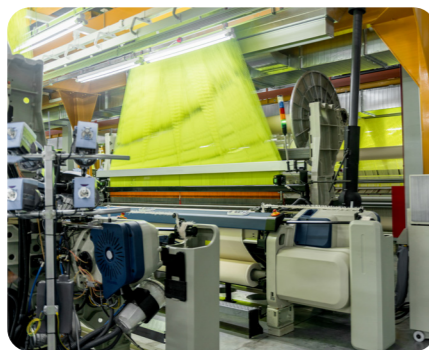
modern electric loom