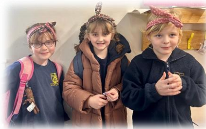
Sowsan has moved to stage 2 and Aisha has moved to stage 6 in swimming now!